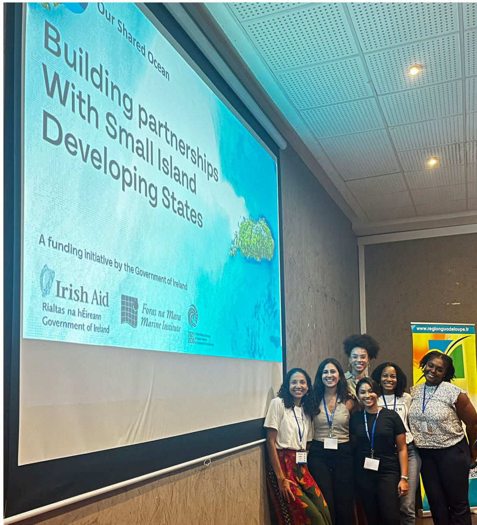
Our Shared Ocean Mobility & Travel Grant Awardees at the Gulf & Caribbean Fisheries Institute Conference 2025, Guadeloupe